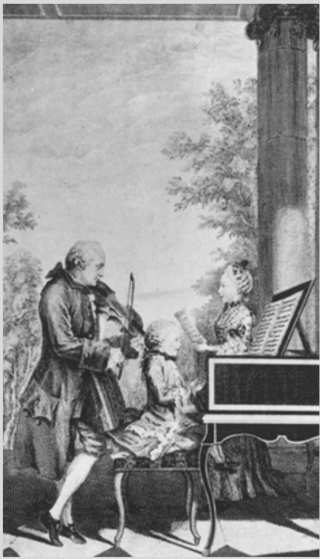
A 1763 engraving of Mozart at the keyboard with his father, Leopold (1719–1787), playing the violin and his sister, Nannerl, singing.