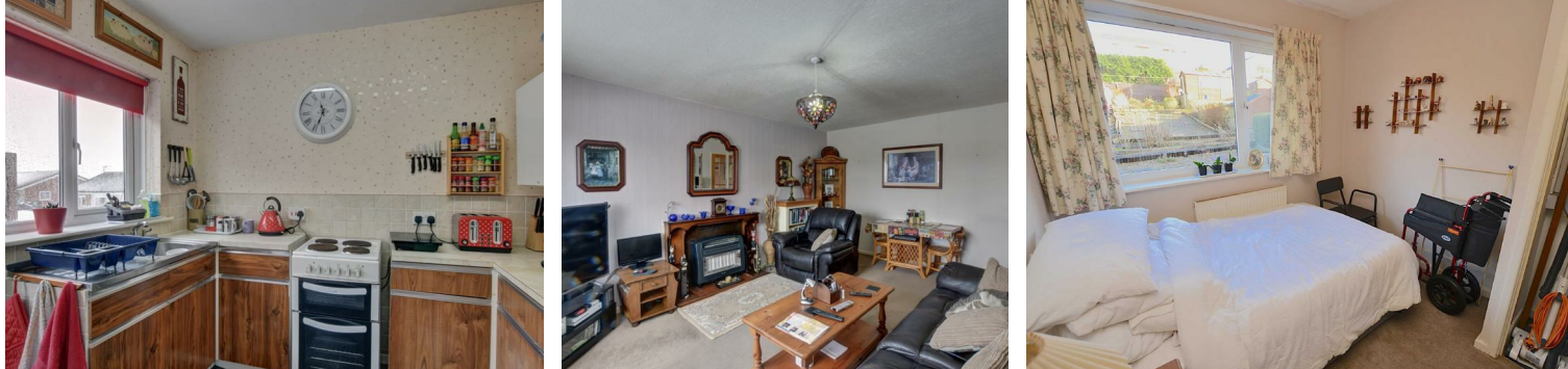
*** NO CHAIN *** Situated towards the outskirts of Burnley towards the top of Red Lees Road at the boundary with Cliviger, this two bedroom semi detached true bungalow occupies a pleasant and tranquil setting and boasts a substantial garden area to the rear. The accommodation briefly comprises, entrance hallway to the front, well proportioned lounge, one double bedroom and one single bedroom situated to the rear of the property.