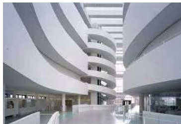
ARoS Aarhus Art Museum